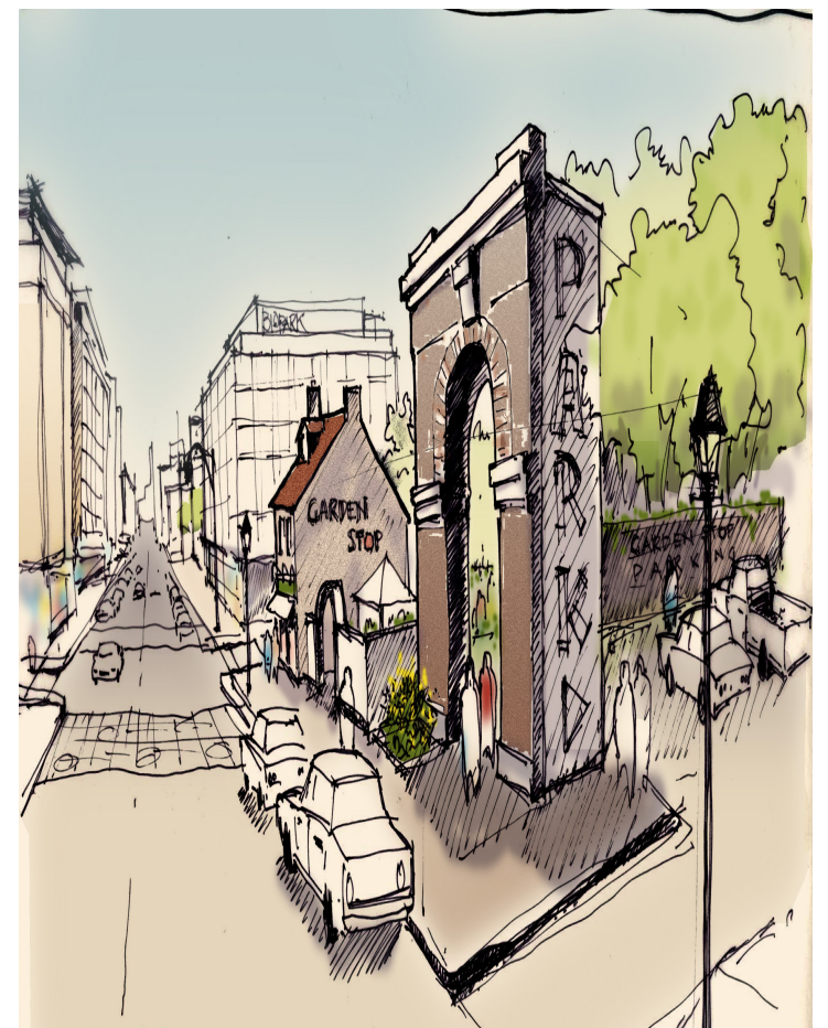
Southwest Partnership Vision plan of West Baltimore St.

Southwest Partnership was awarded over one million dollars from the State of Maryland to acquire and stabilize specific