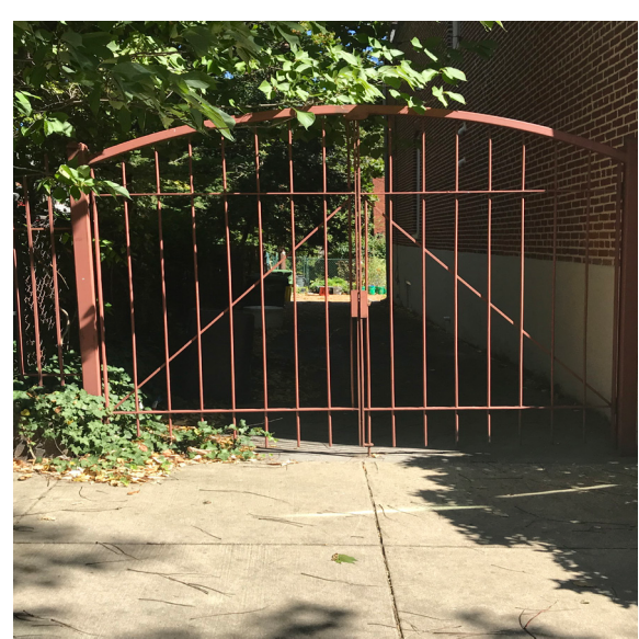
Alleygate on S Gilmor St. and W Fayette St.

Many alleys throughout the seven neighborhoods of Southwest Partnership no longer serve a public purpose. The Alley gating project was created to identify these public places and work to gate them with wrought iron fencing. The fencing of these areas will protect these spaces from litter, debris, and criminal activity creating a safe area for children to play. Alley gating will enhance property values as crime decrease. Southwest Partnership was awarded 200,000 dollars to begin the project. Development will start on the streets just north and south of West Baltimore Street and gradually spread throughout all seven of our neighborhoods.