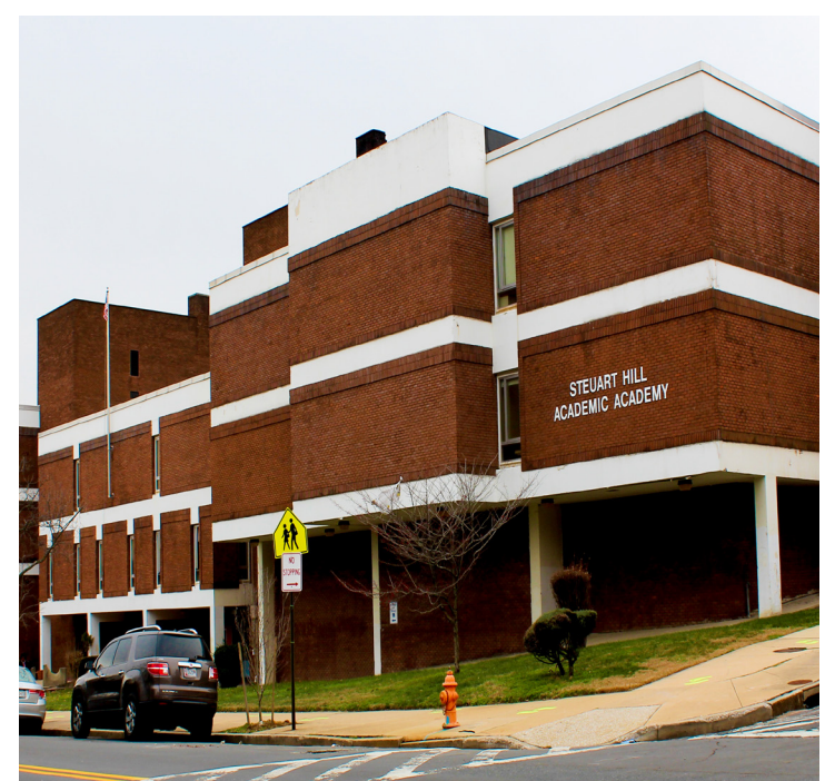
Steuart Hill Academic Academy

The Southwest Partnership Education Committee is working to strengthen all schools within the Southwest Partnership, by making all schools in the area a community schools. Community schools are at the center of their neighborhoods-they bring resources such as after school programs and volunteers. Community schools also bring resources to the surrounding community, serving all of the students' families and community members' needs. Community schools offer resources such as food, housing, job training programs, community space and more. To ensure sustainability and success, each community school should have a fulltime coordinator who will be responsible