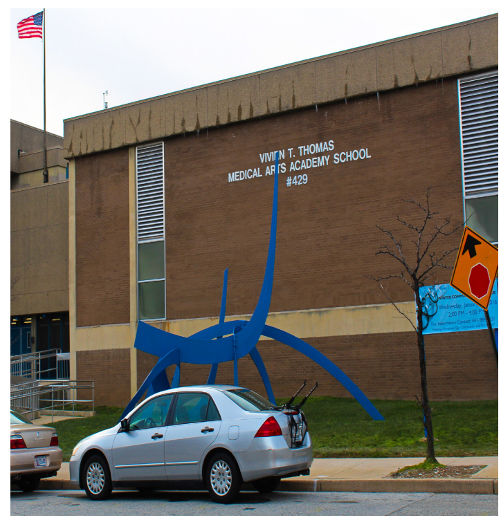
Vivien T. Thomas Medical Arts Academy